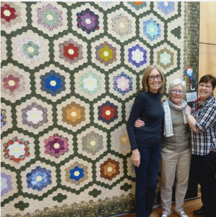
VIEWERS CHOICE by ULA SHEATHER