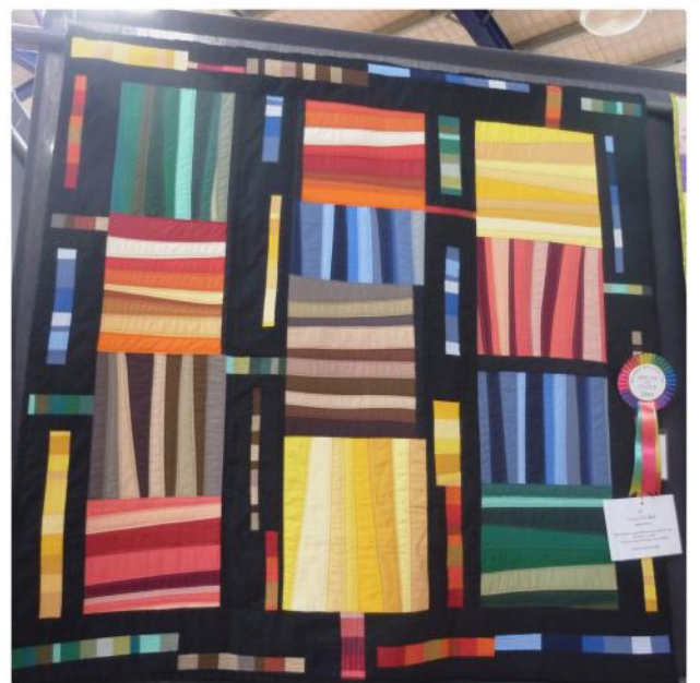
BEST USE OF COLOUR by DENISE FALLON