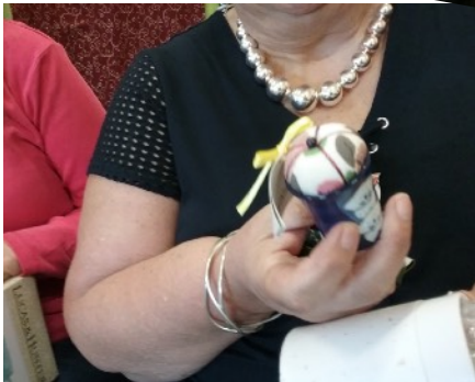
Kris Kringle gifts being opened